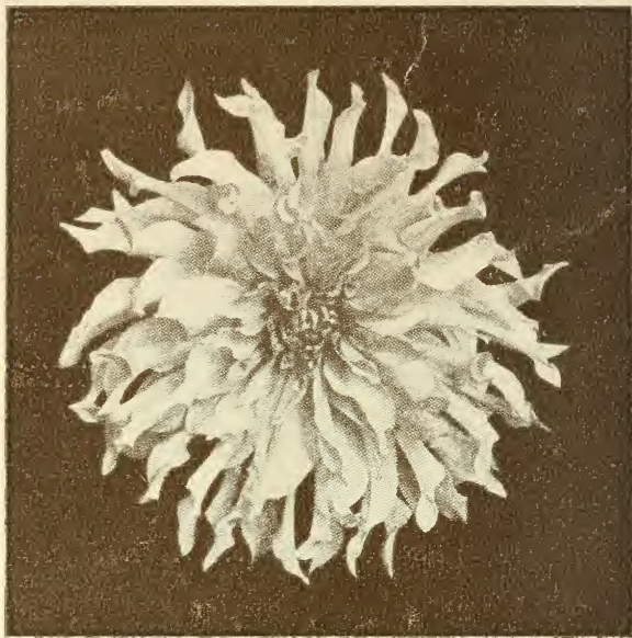
ATTRACTION (See Page 8)